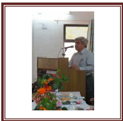
Welcome speech by Director