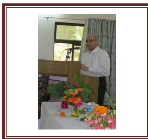
Inaugural Speech by Chief guest